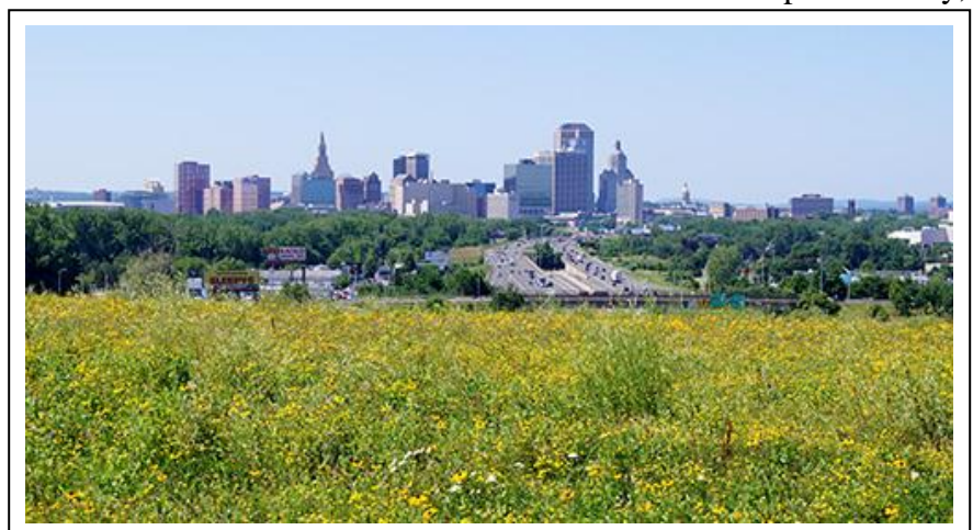
A view of the Hartford skyline from the Hartford landfill, where grasses and wildflowers grow over the synthetic cap installed by the Materials Innovation and Recycling Authority.

With the capping completed, DEEP is now responsible for 30 or more years of monitoring and maintenance <u>under legislation passed in 2013</u>, though MIRA will continue to own and operate the solar facility. What will become of the remainder of the closed landfill is now up to the City, which owns the site.